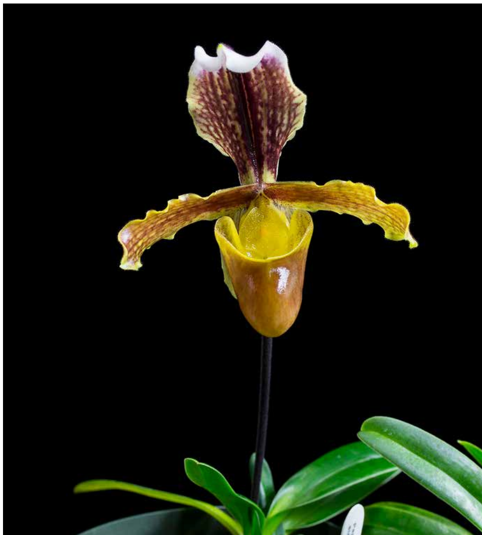
Paph. barbigerum var. sulivongi