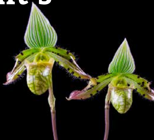
Paph. venustum

"As our show season approaches We encourage everyone to bring as many flowering plants as possible"