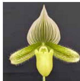
MAY CHAMPION HYBRID