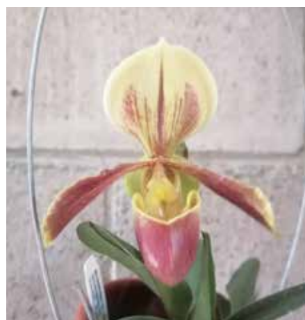
ABOVE: Paph. helenae

I hope we can exchange more about our passion for Paphiopedilums. I'll try to keep you posted. If you're interested in growing Paphiopedilums in El Salvador or elsewhere, you can email me. ( Contact Society for email address )