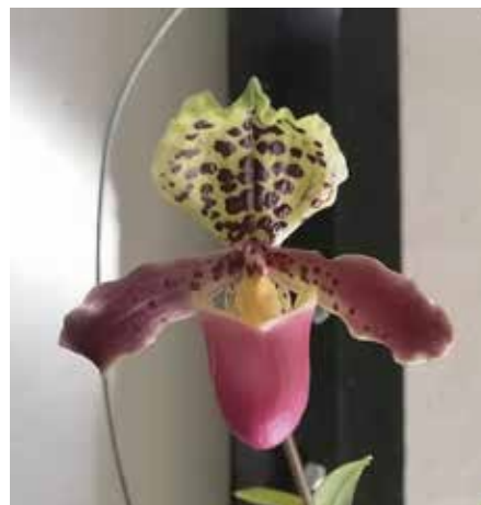
ABOVE: Paph. henryanum