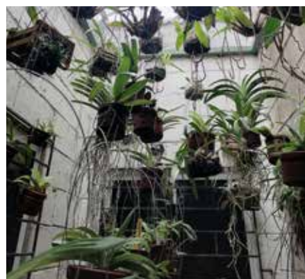
ABOVE AND NEXT PAGE: Jacobo's growing space.