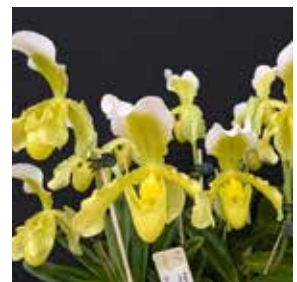
MAY CHAMPION SPECIES