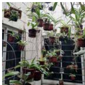
SNEAK PEEK INSIDE JACOBO'S GROWING SPACE